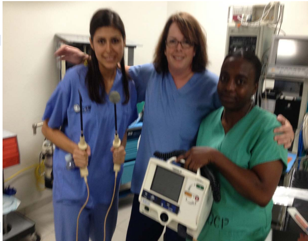
Checking out the new Lifepak Defibrillator

The purchase of all equipment and supplies covered by the Rotary Global Grant was completed in time for use by the September Little Hearts Project team.